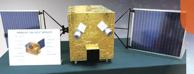
Full scale model of the HKU No.1 satellite